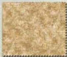
Fabric E 38506-122 5/8 yard