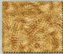
Fabric I (backing) 38510-258 4 yards