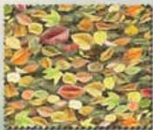
Fabric D 38505-753 1/4 yard