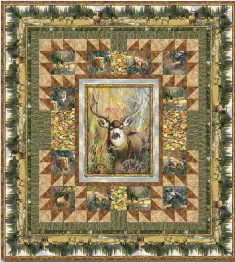
Finished Quilt Size: 59" x 65"