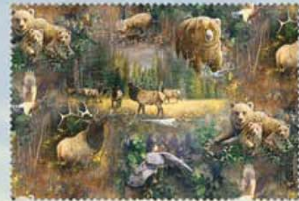
Fabric B 38502-752 1/2 yard