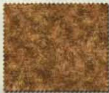
Fabric F (includes binding) 38506-229 1 1/4 yards