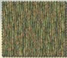
Fabric G 38507-727 5/8 yard