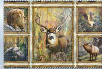
Fabric A 38501-722 1 Panel