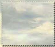
Fabric H 38509-547 1/4 yard