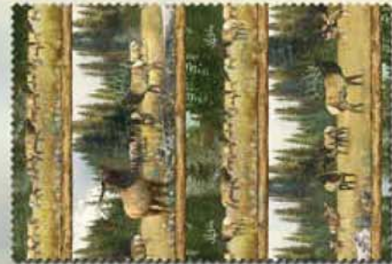
Fabric C 38503-724 2 yards